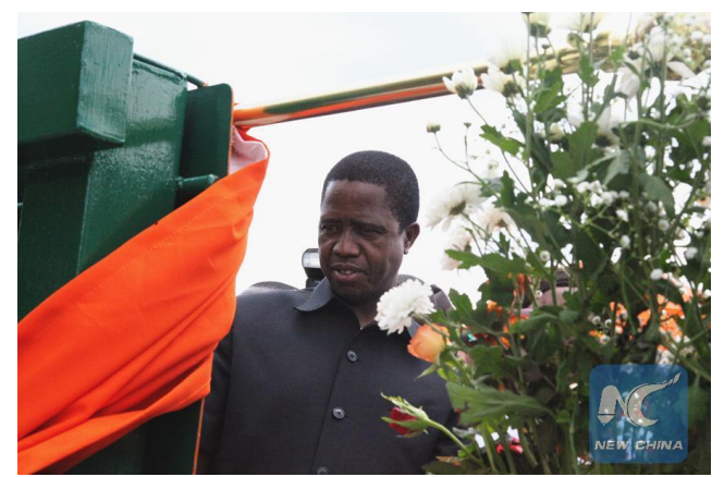
Zambian President, Edgar Lungu, unveils a nameplate at the launch ceremony of Kafue Gorge Lower Hydro-power project in Chikankata, Zambia, on 28 November 2015

contractor will also arrange debt financing from China Exim Bank and Industrial and Commercial Bank of China to fund the project. The Government of Zambia will fund 15 per cent of the cost equity, while the remaining fund will be contributed by the contractor. The power station will alleviate the power shortages not only in Zambia but also in the Southern African Power Pool. [Source: The International Journal on Hydropower & Dams, Volume 23, Issue 1, 2016]